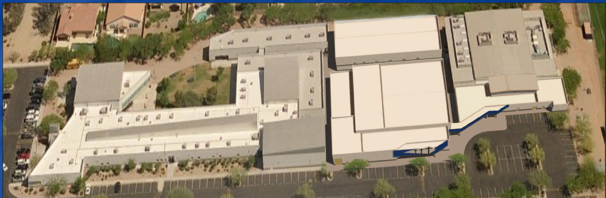
Aerial view of Performing Arts Center

"SINCE GOD CREATED MUSIC, CHRISTIANS SHOULD BE MUSICALLY LITERATE."